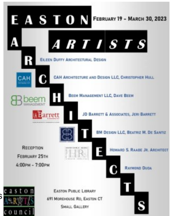
Easton Architects as Artists Exhibition