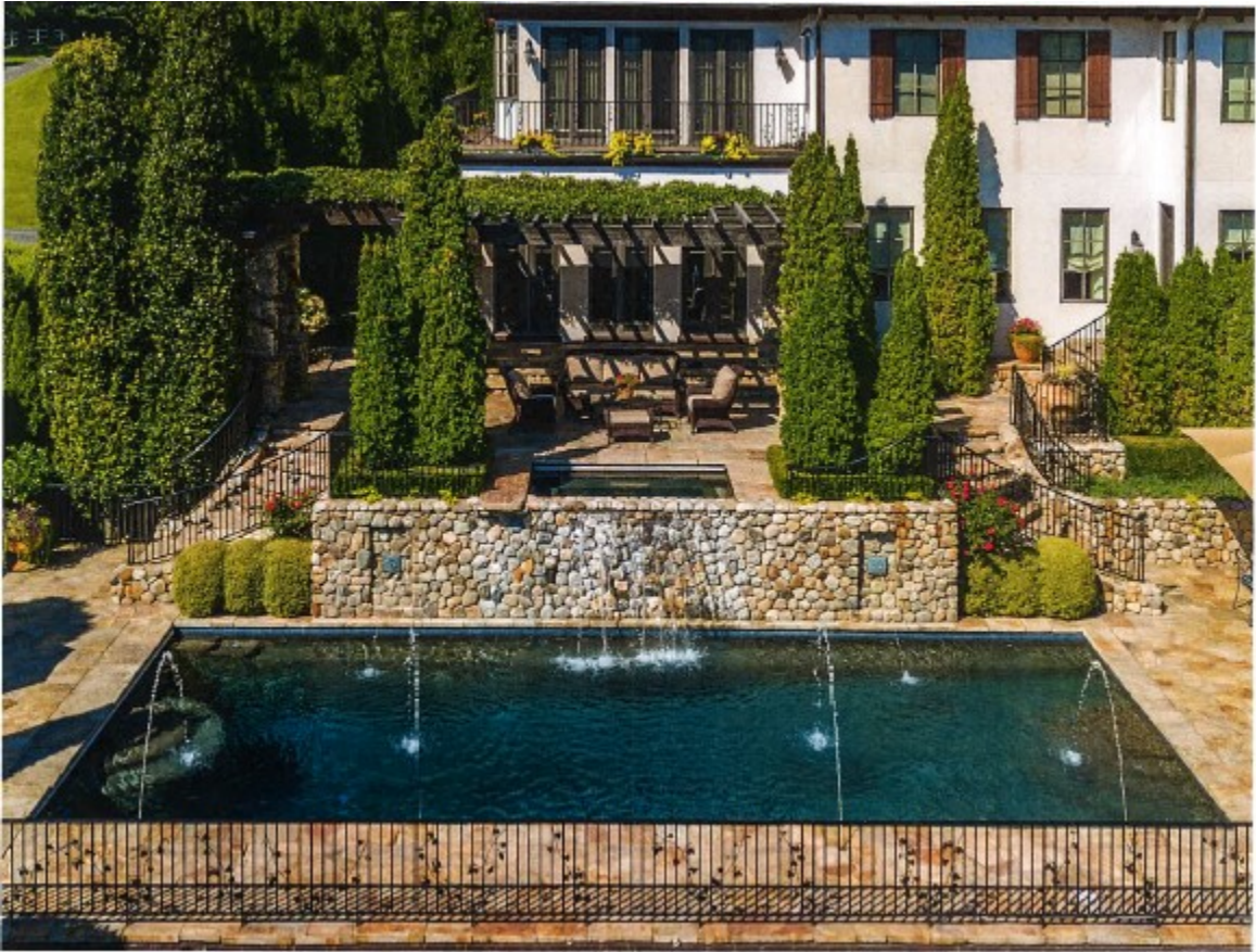
The firm specializes in environmental issues, site planning and wetland permitting.